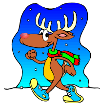
Head up, spine straight, back foot active -- Happy face!

The best walkers I found in the clip art catalog were the dog and the reindeer. Imagine that!